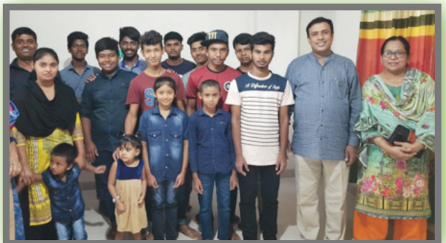
The boys with the project leader, house parents and their children.

Donations to this project BDG-500 will be appreciated.