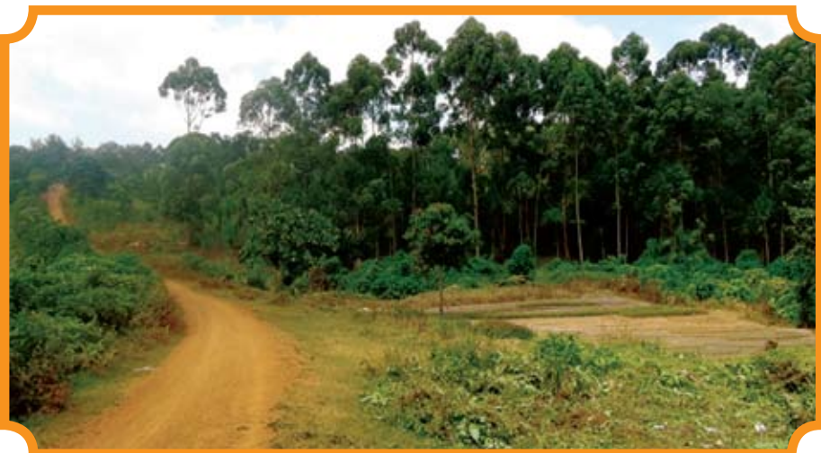
Our land is on the right side of the road

We currently have three volunteers working here in Uganda from