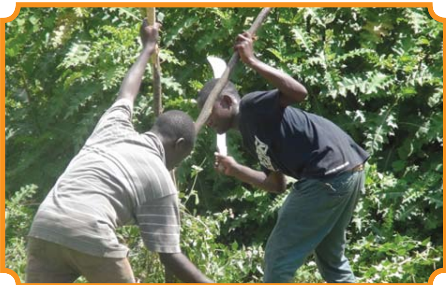
Some of our boys slashing the land.

People here are thankful that we are working here to help the children of Mityana to have a better future and a hope.