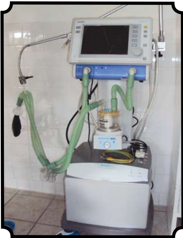
Some of the equipment bought with funds donated through HADA.