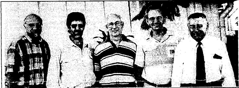
Members of the Management Committee.